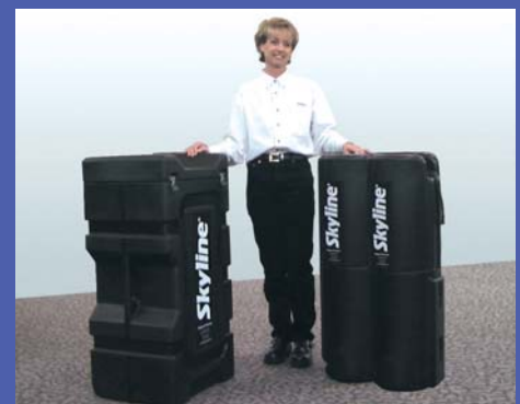
Cases protect your investment Quest packs in a single case for convenience or in two cases that lock together. All cases have wheels for easy transport.

Skyline Exhibits 3355 Discovery Road Eagan, Minnesota 55121 1-800-328-2725 International: 651-234-6592 www.skyline-exhibits.com