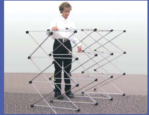
Frame sets up quickly and easily Quest's lightweight aluminum frame pops up in seconds.