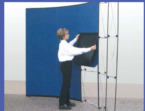
Panels align perfectly for a great look Skyline uses polarized magnets to give you a seamless look. Panels are available in a variety of fabric colors or digital-direct graphics.